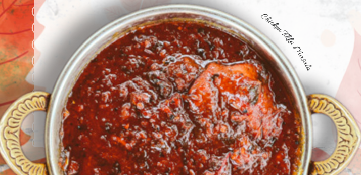
Chicken Tikka Masala

Champy's Bradford Arms is not affiliated with any other pub or restaurant.