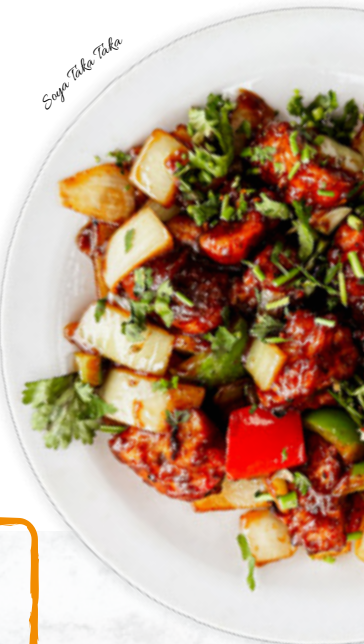
Soya Taka Taka